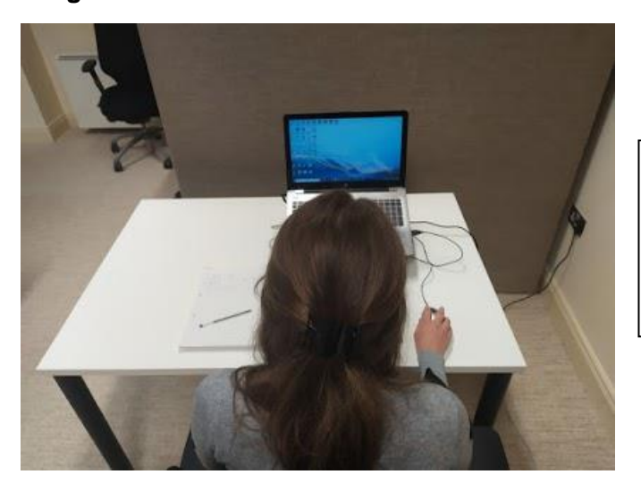
Image 4: Alignment with monitor. - Aim: To see alignment with screen, shoulder height and positioning and layout of desk. Instructions: Stand directly behind person in line with main monitor