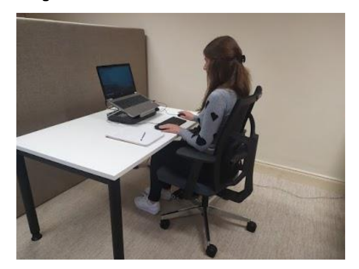
Image 5: Perspective View of workstation - Aim: See different angle of workstation and posture including immediate environment. - Instructions : Step back from workstation, so whole workstation, chair and individual's body and space behind individual is visible