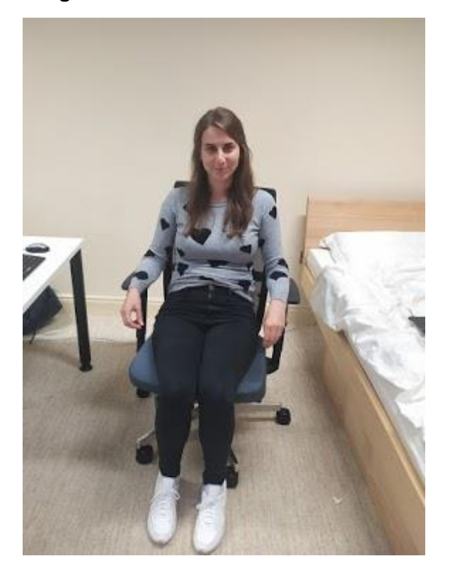
Image 2: Front View of Chair -Instructions: Ensure full chair is visible.