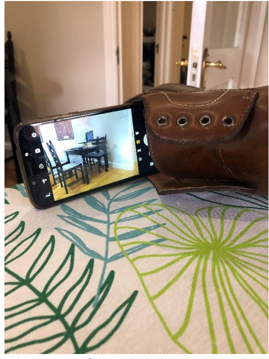
Option 2: Portrait – Only if space is tight and can't see full body in landscape